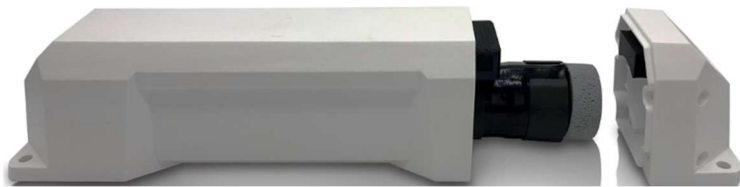
- GL502 Asset Tracker